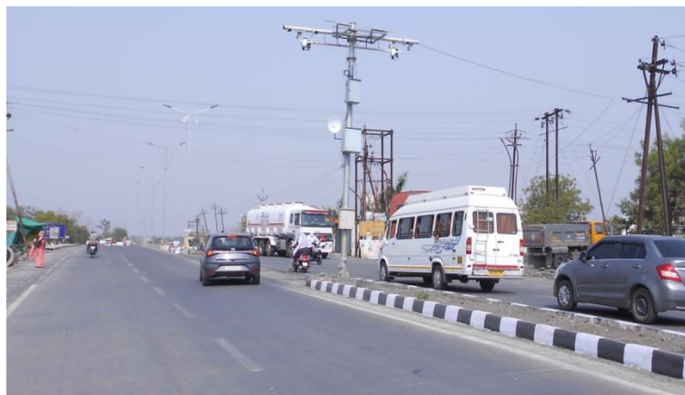
Fig 15: Speed sign board and warning sign board missing

Proper Informatory sign boards, hazard marker as well as storage lane is suggested as this spot of intersection.