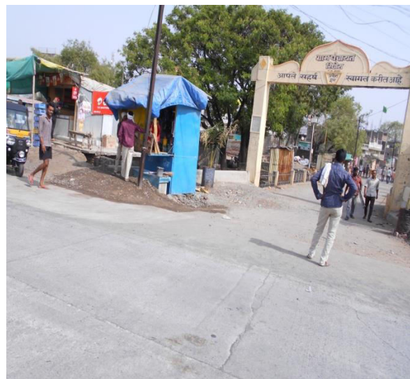
Fig 7: Unraised Pathway