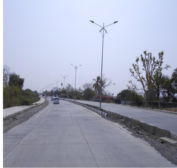
Fig 9: Kerbs missing dangerous at night