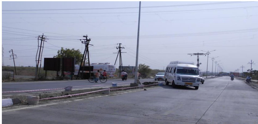
Fig 10: On proper size meridian opening is provided

Median opening must be given large where there is frequent turning of vehicle for specific town / village.”STOP” line and ‘U-turn’ marking must be taken up to manage the drivers legitimately.