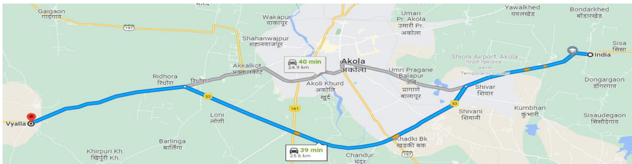
Fig 2: Study Area Route