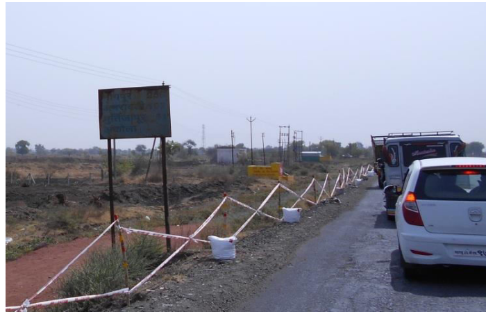
Fig 5: Informatory Sign Board