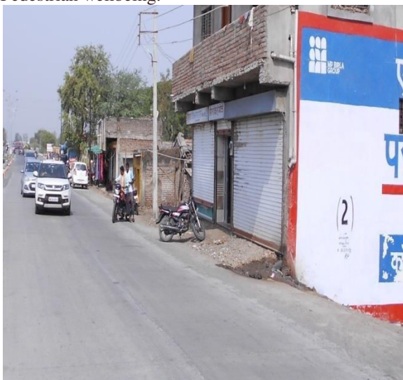
Fig 6: Footpath absent with barrier

Separate pathway should be given around the local area and town territory for wellbeing of pedestrian. Pedestrian guardrail might be given at the spots where pedestrian movement is high and on raised pathway in favours of carriageway at transport stops and transport coves for satisfactory length yet at least 10 m on either side for Pedestrian wellbeing.