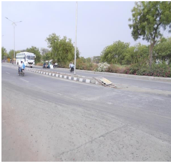
Fig 8: Dangerous meridian opening