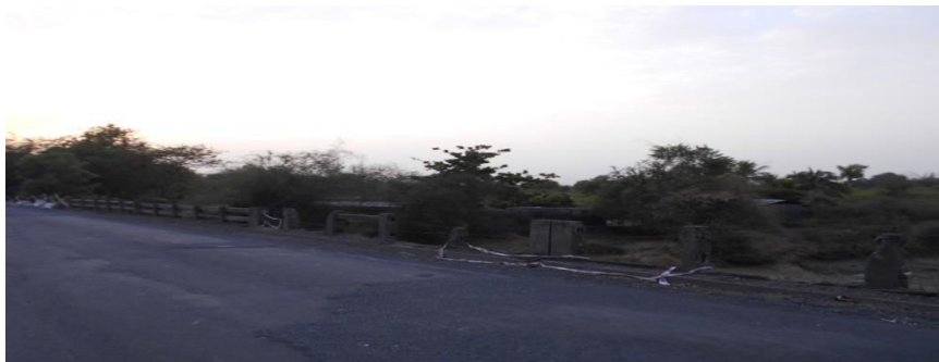
Fig 11: Bridge railing missing

Bridge Railing must be maintained regularly and height of the railing also be increased so as to avoid any future hazard to the road users