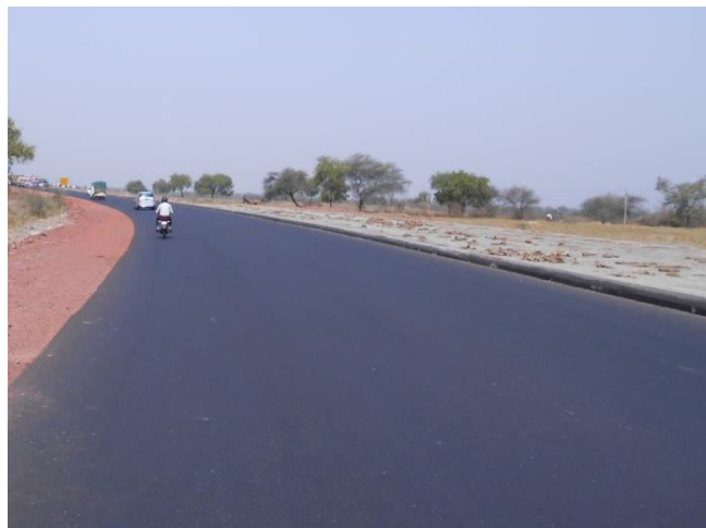
Fig4: Regulatory Sign Boards

It is necessary to provide continuous regulatory sign boards on every curve as well as speed limit sign board as it warns the driver to reduce the speed of the vehicle so the vehicle should not topple in other lane and cause major accident.