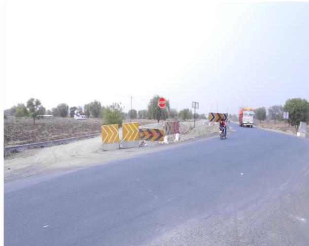
Fig 3: Hazard Marker Sign and Diversion Sign

It is necessary to provide continuous regulatory sign boards on every curve as well as speed limit sign board as it warns the driver to reduce the speed of the vehicle so the vehicle should not topple in other lane and cause major accident.