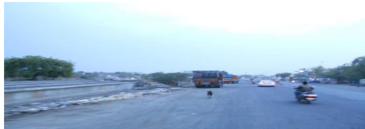
Fig 14: Roadside parked vehicles

The RSA group recognized areas where the roadside barrier (Fig.5.9) was hindered short separation. This would bring about an errant vehicle entering the unprotected zone to be "caught", with no plausibility to hold control and collide with roadside impediments behind the obstructions. The establishment of a solid boundary of suitable stature and length and exceptional treatment of move ranges between the diverse sorts of restriction frameworks was suggested.