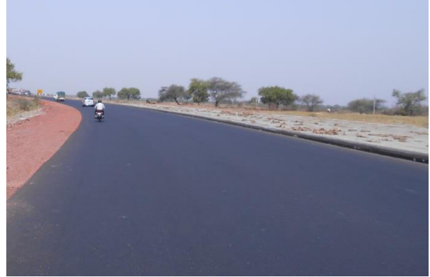
Fig 13: No Marking