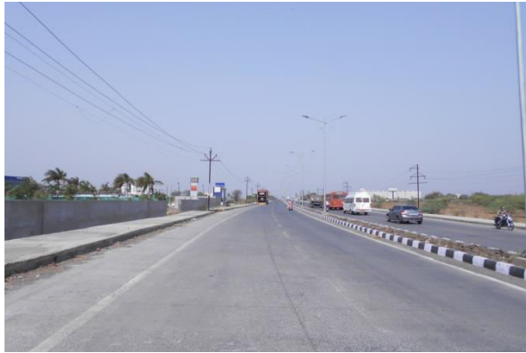
Fig 12: Blurred Marking

been expelled viable. New markings are suggested as absence of the marking will confuse and mislead the drivers about their boundaries of lanes. Use of an excellent retro intelligent material compelling in rain and haziness with sufficient slip resistance qualities was prescribed.